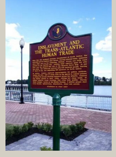
A Middle Passage port marker was unveiled along the Perth Amboy waterfront in remembrance of the city's role in trans-Atlantic human trade of captive Africans.

Please see Middle Passage article and Schedule of Events on Page 4