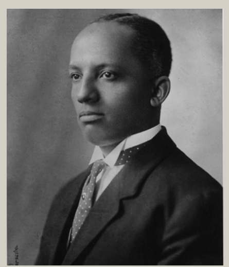
Carter Goodwin Woodson

Founder Black History Week precusor to Black History Month