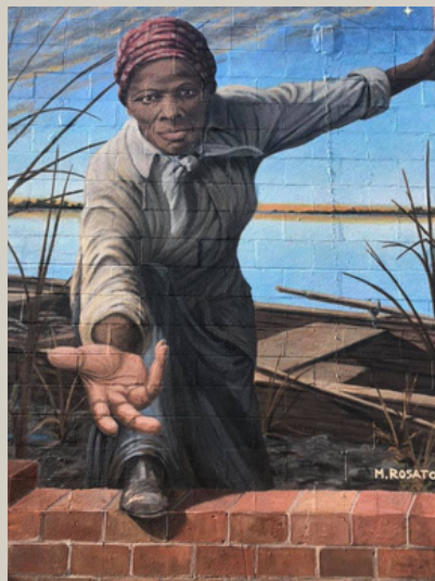
Harriet Tubman, heroic liberator of slaves

..... Founder Black History Week precursor to Black History Month