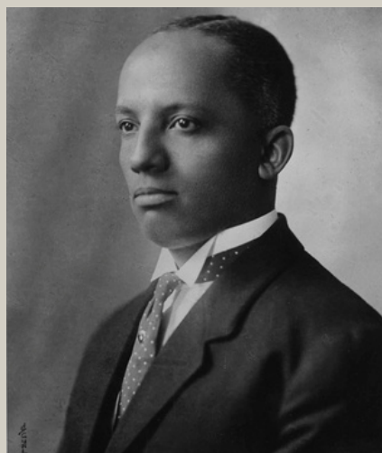
Carter Goodwin Woodson

..... Founder Black History Week precursor to Black History Month