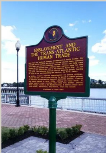
A Middle Passage port marker was unveiled along the Perth Amboy waterfront in remembrance of the city's role in trans-Atlantic human trade of captive Africans.

Please see Middle Passage article and Schedule of Events on Page 4